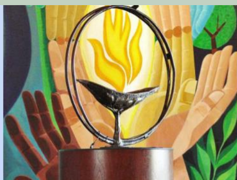
Photo: Mural in the Unitarian Universalist Church of Annapolis sanctuary

Sponsored by the Pastoral Care Associates at WUS