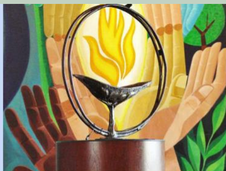
Photo: Mural in the Unitarian Universalist Church of Annapolis sanctuary