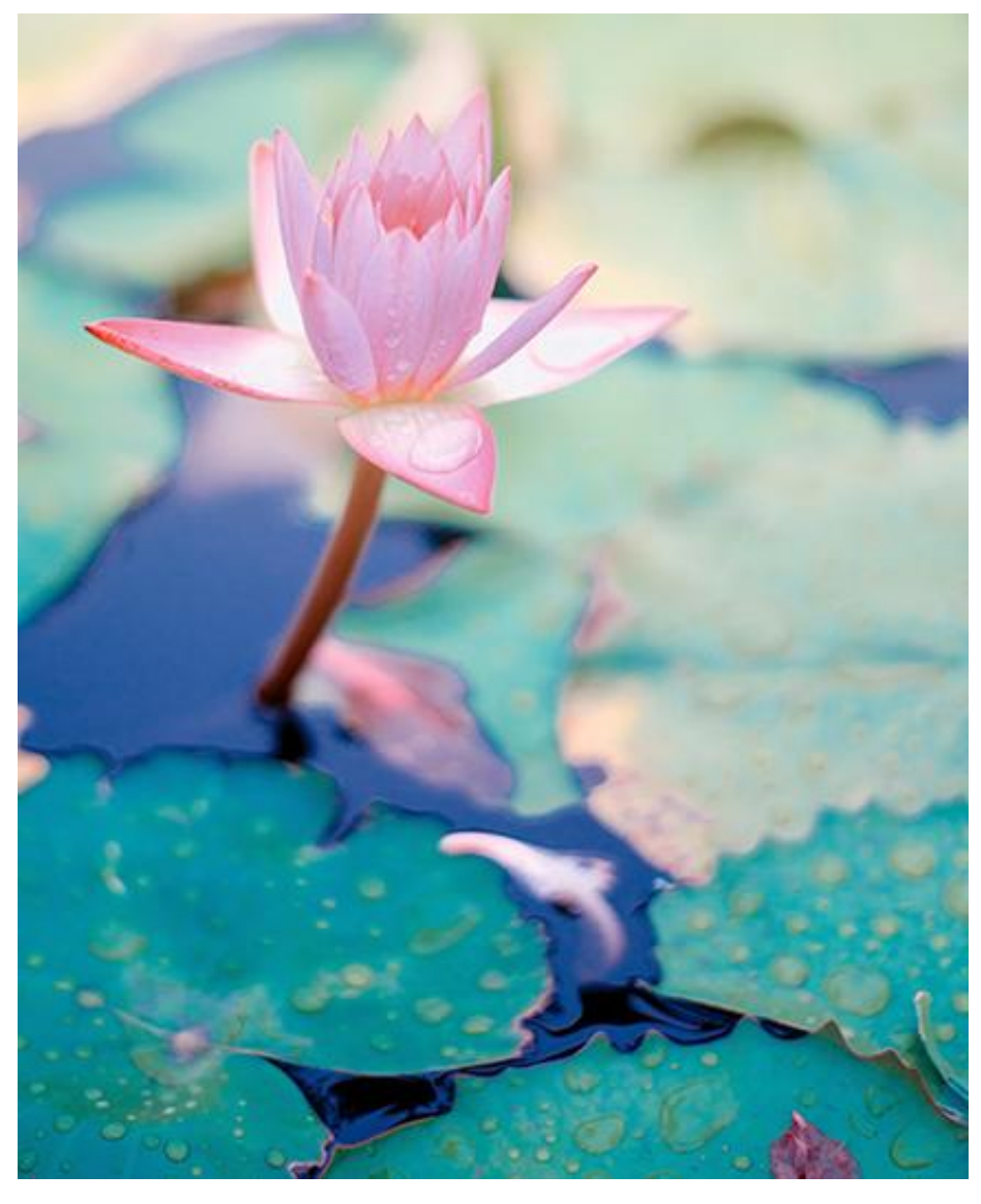
The Theme for May is

(link to today's full issue of Highlights)