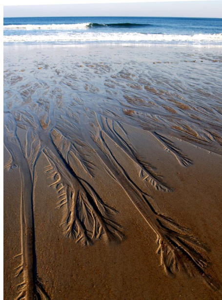
Photo: "Ocean's Reach" by Bob Janules. This photo not only reflects the ocean's "embracing" nature but is also shared in celebration of Water Communion and recognition of the meaning of fractals in adrienne maree brown's "Emergent Strategy"

(link to today's full issue of Highlights)