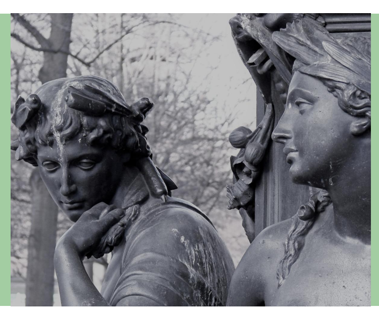
The Theme for October is Deep Listening

(link to today's full issue of Highlights)