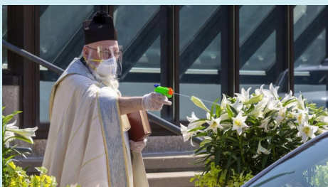
Photo: A priest gets creative in blessing congregants with holy water.

For now, we are assuming that we will be offering virtual worship and programming at least until the end of August...Stay healthy and safe, everyone!