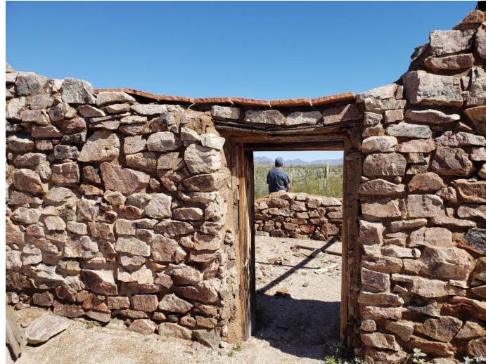
Remains of a 19th century dwelling in Organ Pipe national monument, AZ.

(link to today's full issue of Highlights)