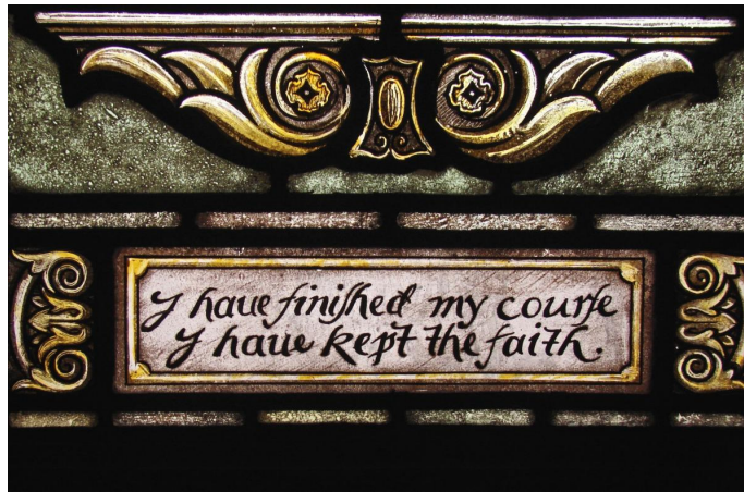
Photo illustrating this month's theme of "Integrity" - A photo from a panel of stained glass at First Parish, Plymouth, MA