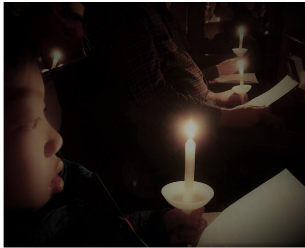
Photo illustrating this month's theme of "Awe" - A photo from Christmas Eve worship at WUS, 2018. Reprinted with permission.