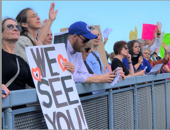
Photo illustrating this month's theme of "Belonging" - the interfaith vigil at the South Boston ICE detention center on September 29 th . Detainees can see the vigil from the facility. Each time there is a vigil, detainees wave, knock on windows and hold handwritten notes against the glass. Those participating in the vigil wave and hold affirming signs in response.