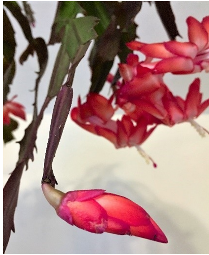
Photo: A Christmas Cactus Blossom Anticipates the Future