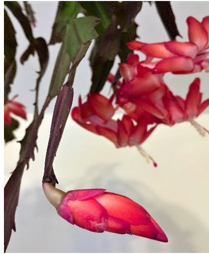
Photo: A Christmas Cactus Blossom Anticipates the Future